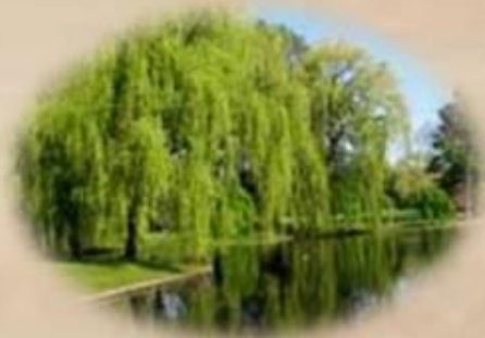
HIGH PRIESTESS Willow