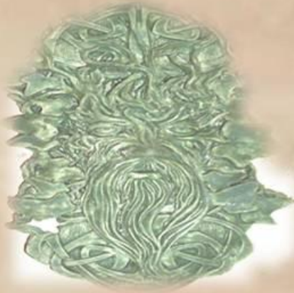
THE FOOL The Green Man