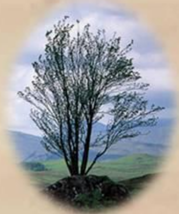
THE EMPRESS Rowan